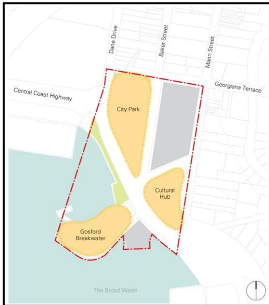
Figure 1: The Gosford Waterfront - Special Areas and Uses